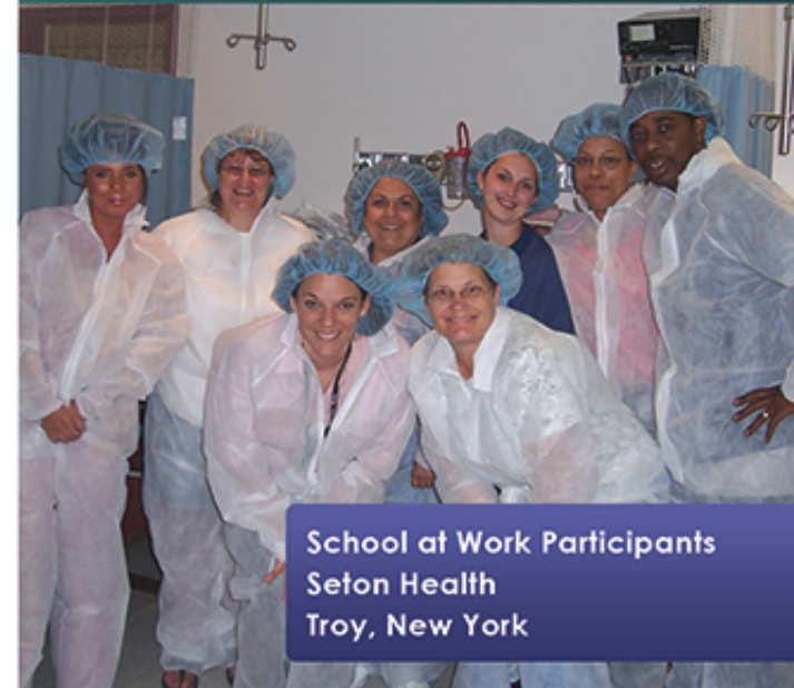
School at Work Participants Seton Health Troy, New York